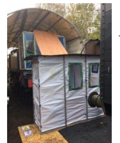
The picture on the left shows asbestos removal under way